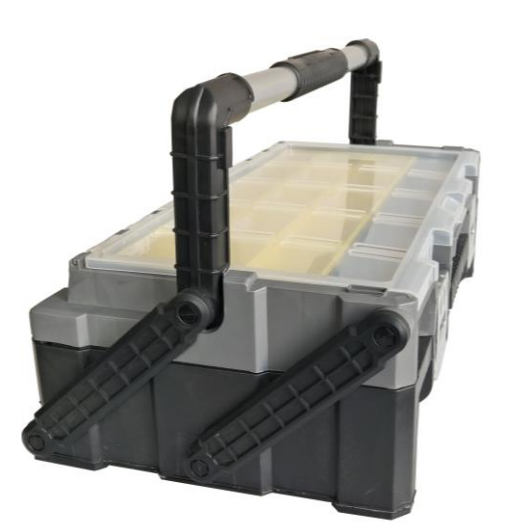
Figure 3. Side View