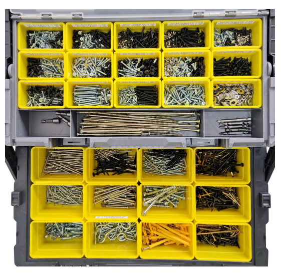
Figure 6. Multi-functional and Retrievable