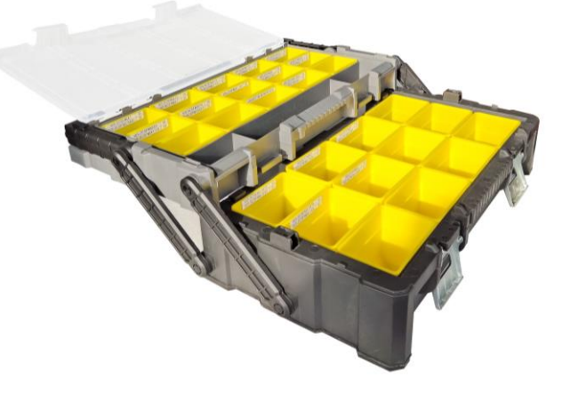
Figure 4. A Trapezoidal Tiered Design