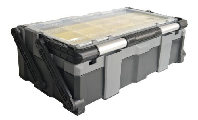
Figure 2. Back View