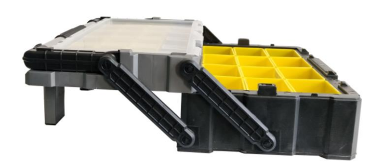
Figure 5. Cantilever Latch Design